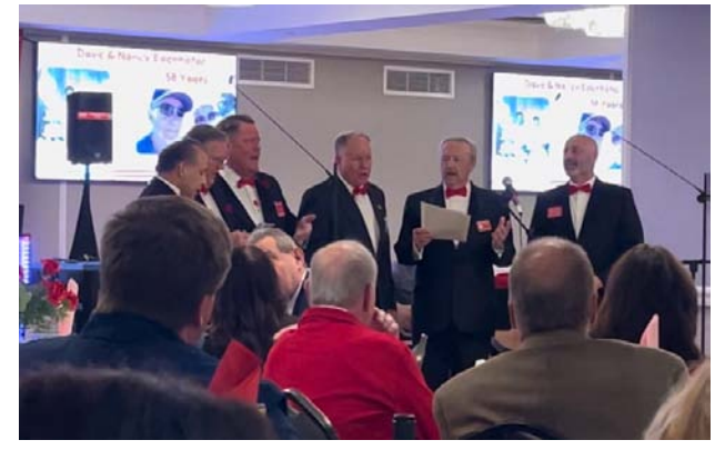
A serenade from a few of our dashing knights...