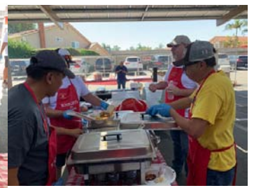
Knights hard at work