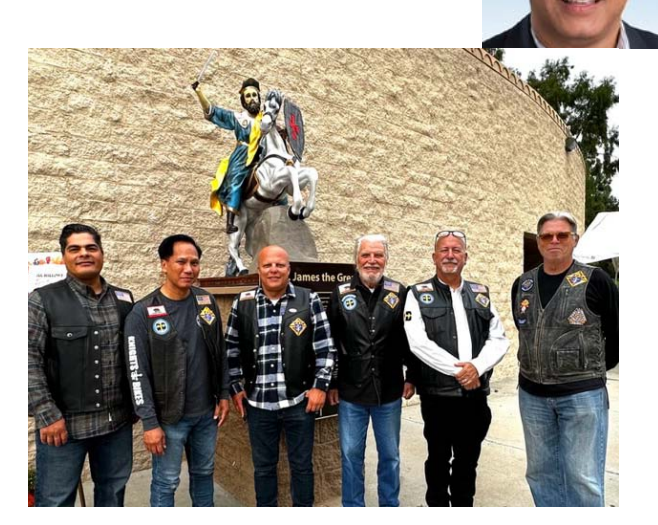
My Brother Knights:

Looking for a few good St. Kilian Motorcycle Riders! If you own and ride motorcycles or know of any male St. Kilian parishioners that ride, please consider Knights on Bikes (KonB), a group of practical Catholic gentlemen. Knights of Columbus membership required. There are no other associated dues for KonB membership.