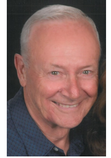
JANUARY 3, 1936 - FEBRUARY 20, 2020